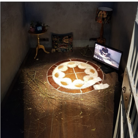
Artwork on display in the old cells at the Museum

Pied Oyster catches at the back of the museum.