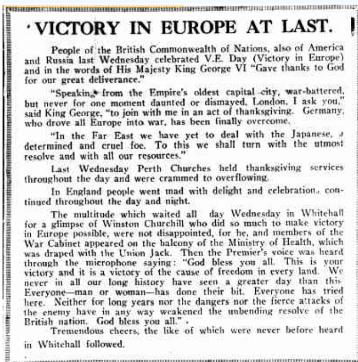
Article from South West Advertiser, May 1945.