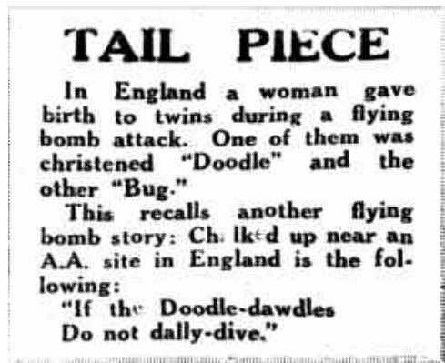
Articles from Western Mail - Perth. August 1945.